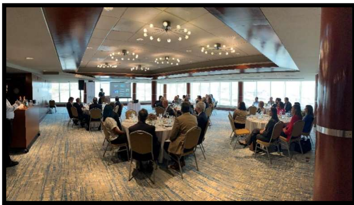
Annual Lunch 2019

The SAPR had its annual lunch for members and invited guests on Thursday, August 8, 2019 at the Club Náutico se San Juan.